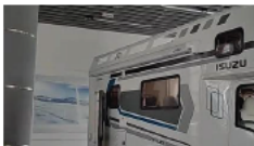
Isuzu 700P light truck independent kitchen,